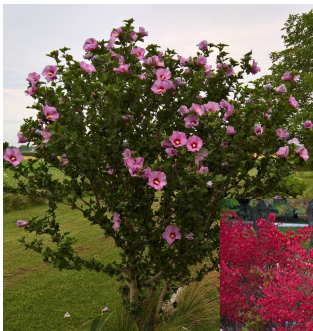
Rose of Sharon