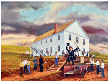
Constitution Hall 1856