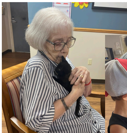
National Kitten Day