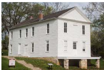
Constitution Hall 2023